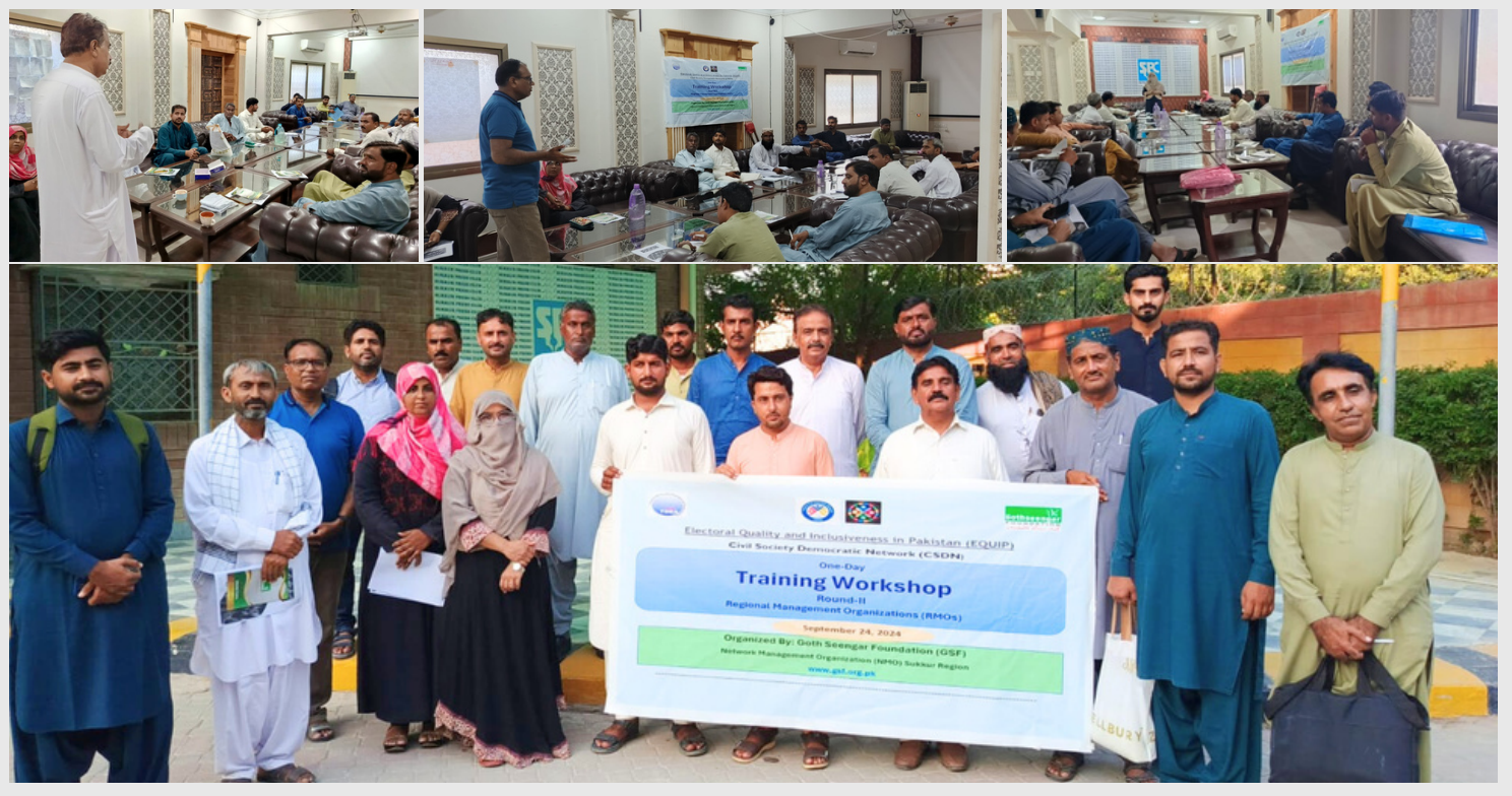
Electoral Quality & Inclusiveness in Pakistan (EQuIP) TDEA/FAFEN Funded Project

Training of Regional Management Organizations (RMOs) at Press Club Sukkur